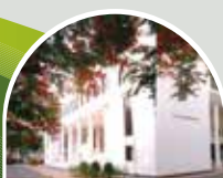
Senate Bhaban University of Dhaka