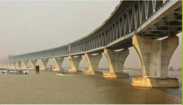
Strength of the Leader