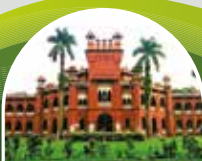
Curzon Hall University of Dhaka