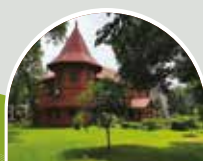
CIRDAP Dhaka, Bangladesh