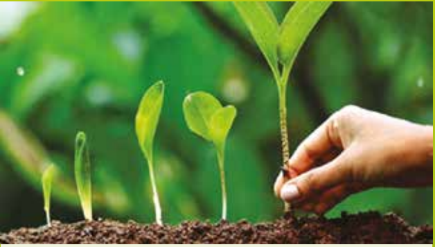
The Green Carpet