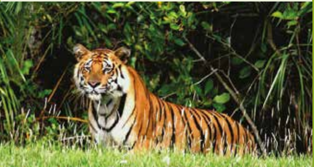
The Magnificent Mangrove